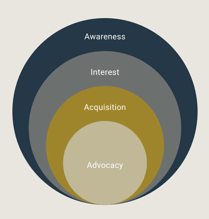
Full Funnel Approach